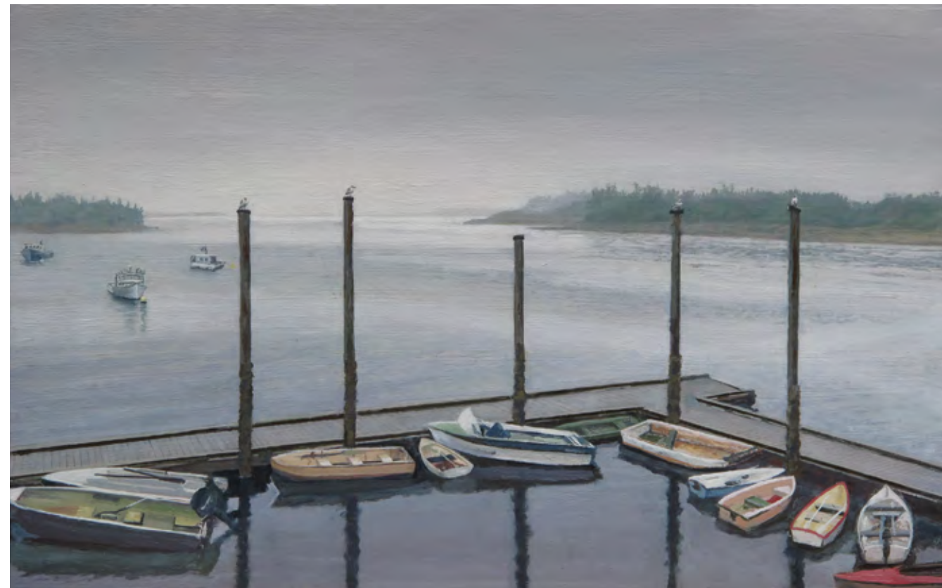
Low Tide Dock , oil on panel, 10 x 17 inches

—Karin Wilkes Courthouse Gallery Fine Art